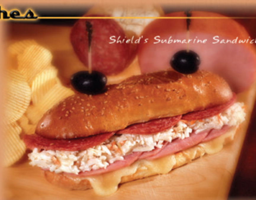
Shield's Submarine Sandwich

Or make it a Philly by adding sautéed onions, mushrooms and green peppers for 1.00