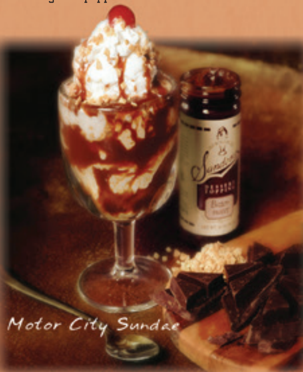
Motor City Sundae

Don't forget to Ask About our Delicious Desserts